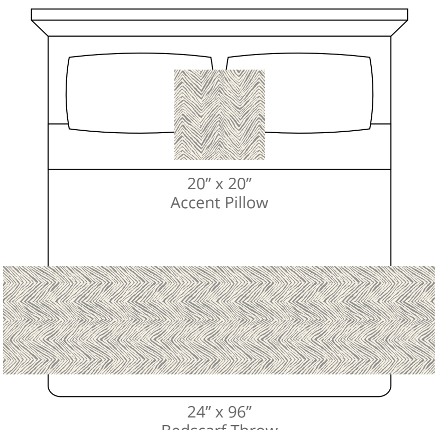
24" x 96" Bedscarf Throw King mattress

*Start/Finish edges must be Polypropylene excluding Brite yarns