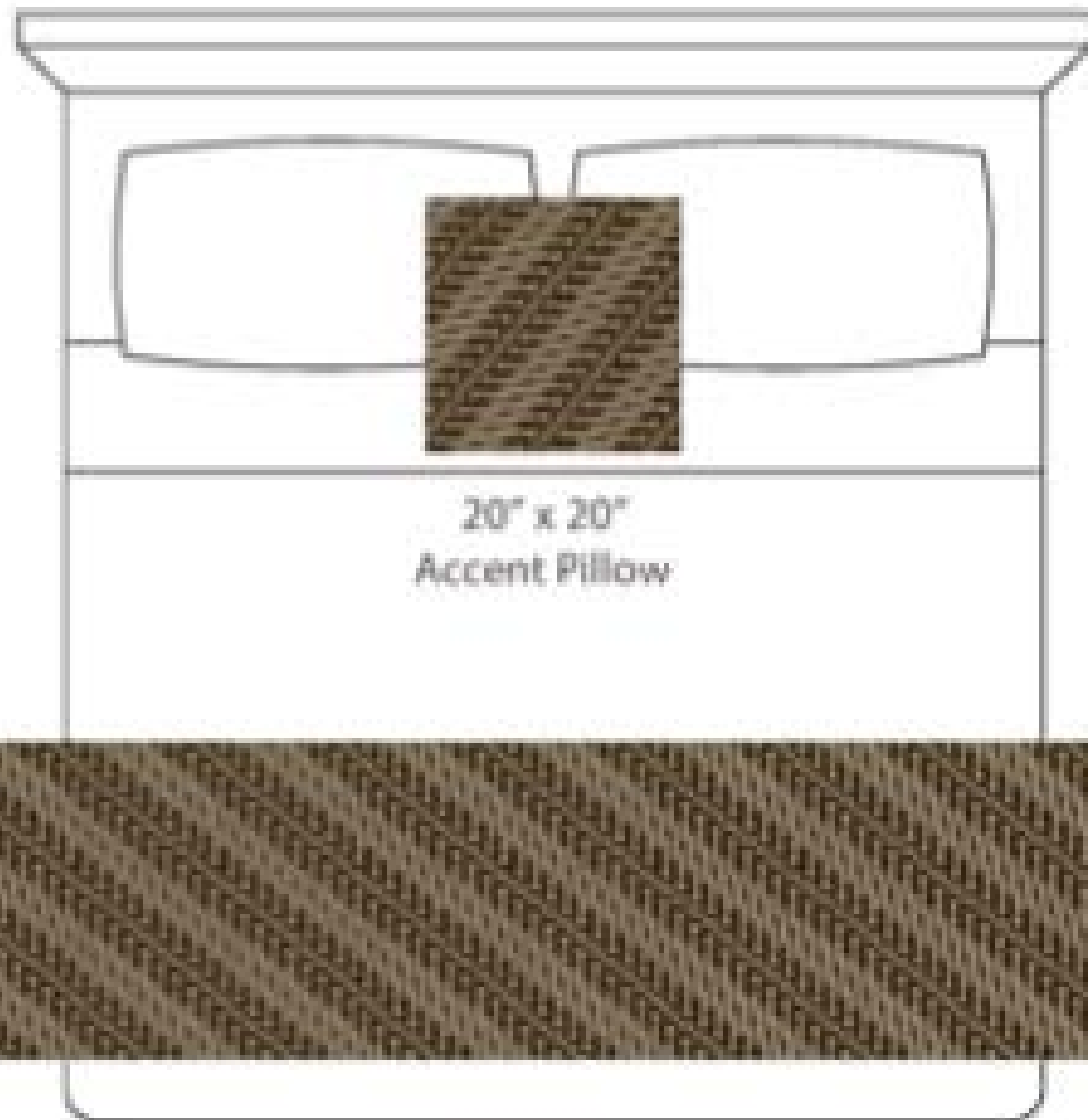
20" x 20" Accent Pillow

*Start/Finish edges must be Polypropylene excluding Brite yarns